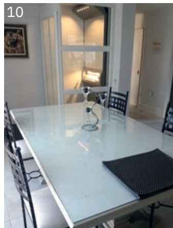
10 The fully commissioned Aritco 4000 domestic platform lift installation in the kitchen on the ground floor of the residence