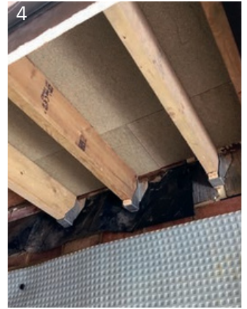
4 On-site building work exposed the lower level ceiling so a hole could be cut out to allow construction of the platform lift shaft