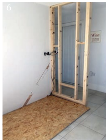
6 The solution was to slightly lower the floor in front of the lift rather than the costly option of raising the ceiling above the shaft