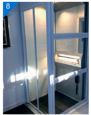
8 Additional vinyl flooring was ordered via a UK stockist allowing the new flooring on the ground level to match the flooring in the lift