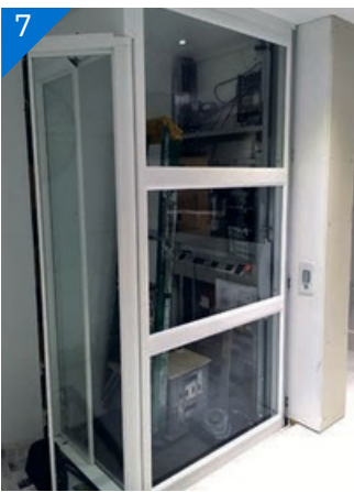
7 The Aritco 4000 installation begins with the electric supply being wired in and full testing and commissioning of the lift completed