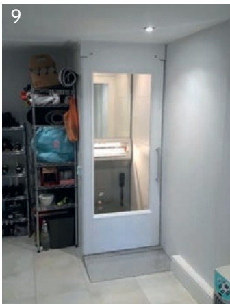
9 The final domestic platform lift installation in the lower storage area of the residence at hand over by Nova Lifts and Builders CPM