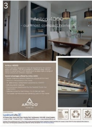
3 The Aritco 4000 platform lift was specified by Nova Lifts to meet the project requirements for the domestic installation