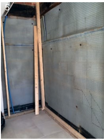
5 The staircase was removed and the lift shaft was built to overcome the issue of insufficient head room for the chosen model