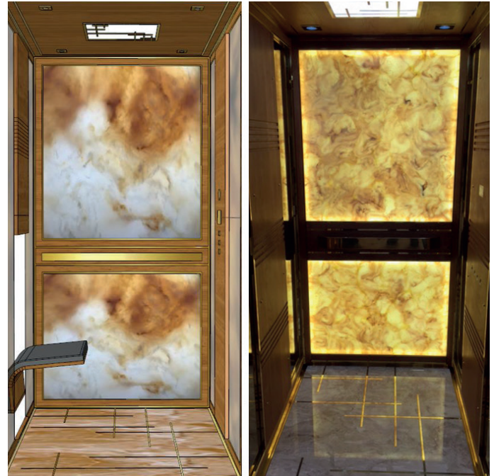
Concept of Lift Car Interior

Such specialist lift car finishes required dealing with outstanding suppliers and manufacturers in the Far East, with UK representative visits with HMY to ensure full compliance with the concept design. Special acrylics were sourced from China and impregnated with LED back lighting to produce this stunning effect for the rear wall.