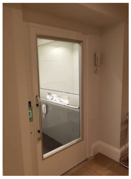
Aritco 7000 series platform lifts, installed at full height, for people with impaired mobility