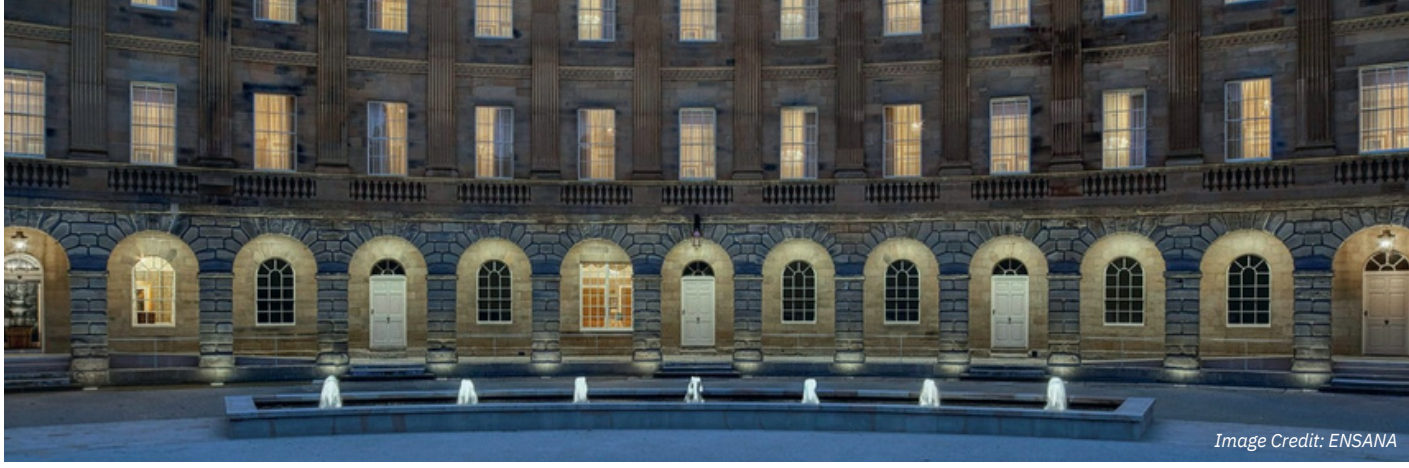
Two lifts, installed by Nova Lifts, finished in gold brushed stainless steel, visible through through the open window of the Buxton Crescent