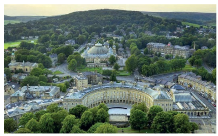
Buxton Crescent today, with the hills of the Peak District beyond

Aesthetics The bespoke passenger lifts located in reception were specified to complement the stunning, surrounding décor. The lift landing doors were specified in a gold brushed stainless steel, with the skirtings, ceiling, hand rails and controls all in a gold stainless steel with a satin finish, set against an intense black granite floor. The internal cabin fit out was completed by the Client with a burgundy leather panel finish wood panelling to the lower wall section and mirrors above. The lift finish is sleek and stylish, complementing the marble floors and décor of the walls and antique brass finishes of the design concept for the hotel reception.