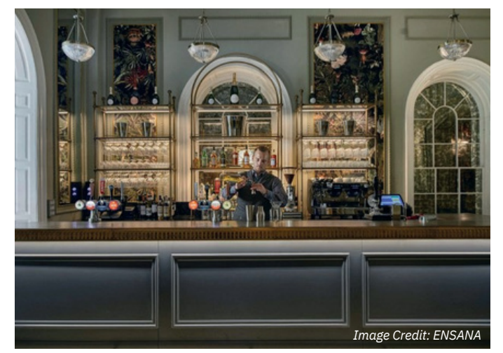
The newly refurbished bar

The short travel scissor lift located at the entrance to the hotel restaurant was specified with glazed doors for an open aspect, and to provide access to level changes between the hotel lobby and restaurant for people with impaired mobility.