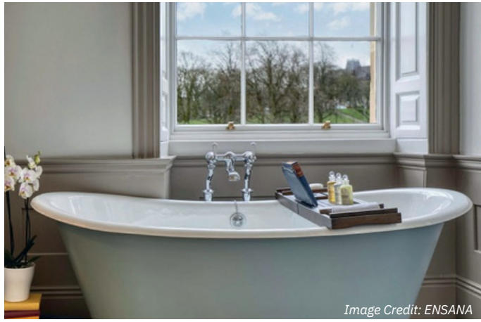
Newly refurbished bathroom with a view of the town