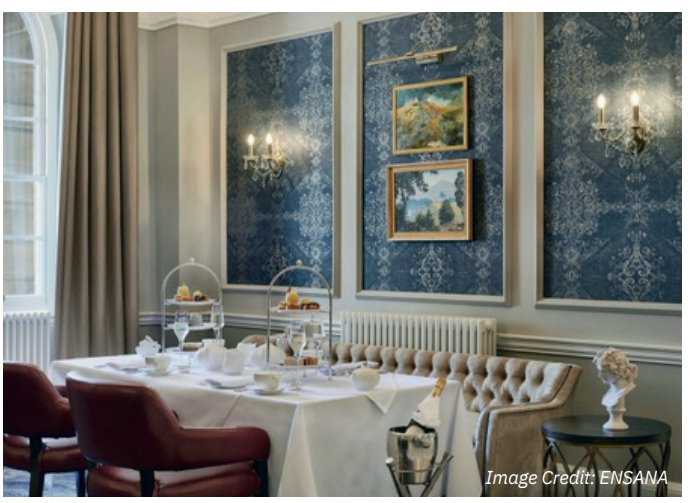
Afternoon tea in the dining room

also showcases our ability to provide technical solutions to meet demanding building works specifications ensuring the success of a customer installation both technically and aesthetically.