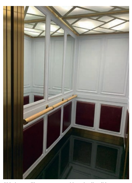
Skirting, ceiling pattern and hand rails all in a satin gold finish and burgundy wall panels