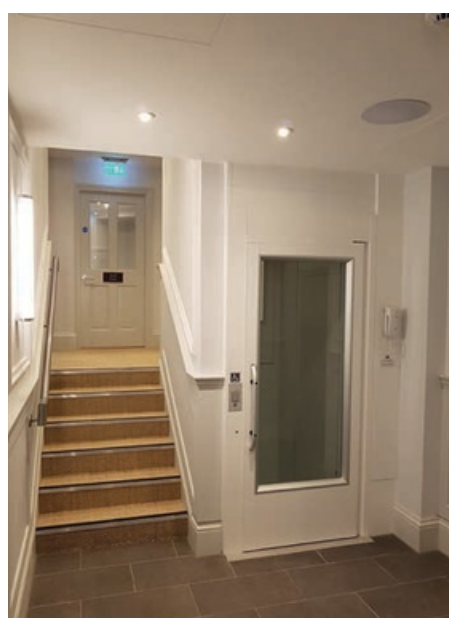
Platform lifts allow easy movement between small floor level differences within the hotel