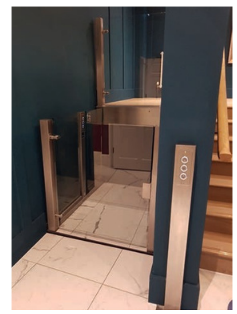
A stylish, modern scissor lift installed in the hotel reception for visitors with impaired mobility