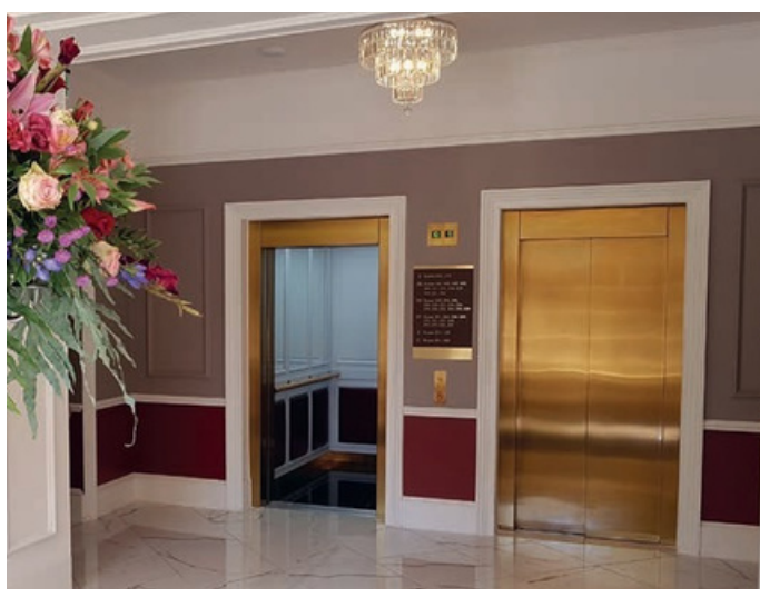
Two passenger lifts installed by Landmark Lifts in the hotel reception