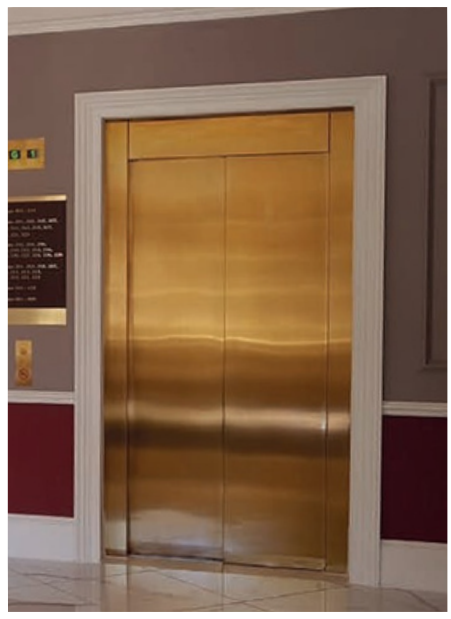
Three bespoke passenger lifts finished with brushed gold stainless steel landing doors