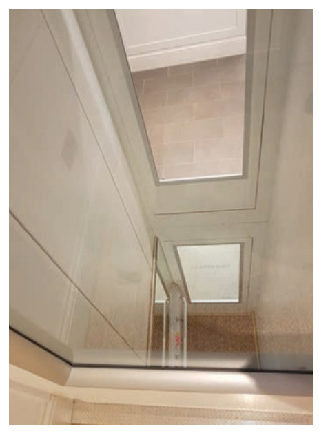
A modern, two stop platform lift installation, specified with glass doors for maximum visibility