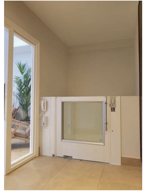
One Aritco 7000 platform lift with a half height door finished in white, for disabled access