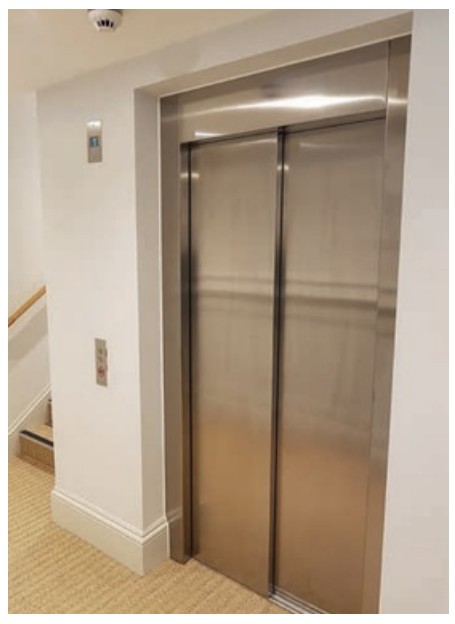
Passenger lift installed with a bright stainless steel finish for all fittings and landing doors