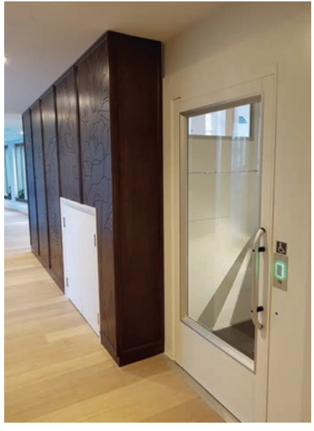
An Aritco 7000 series platform lift, specified to suit the internal décor of the hotel reception